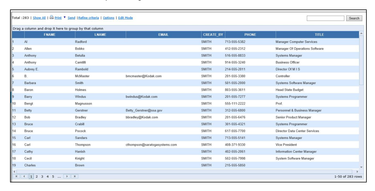
Figure 1 Report Results